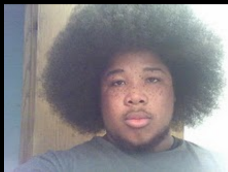
AND his giant fro :)