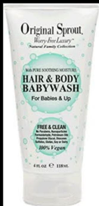
4oz Hair & Body Wash